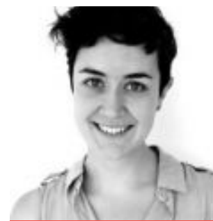
Irmak Turan Commissioner At-Large