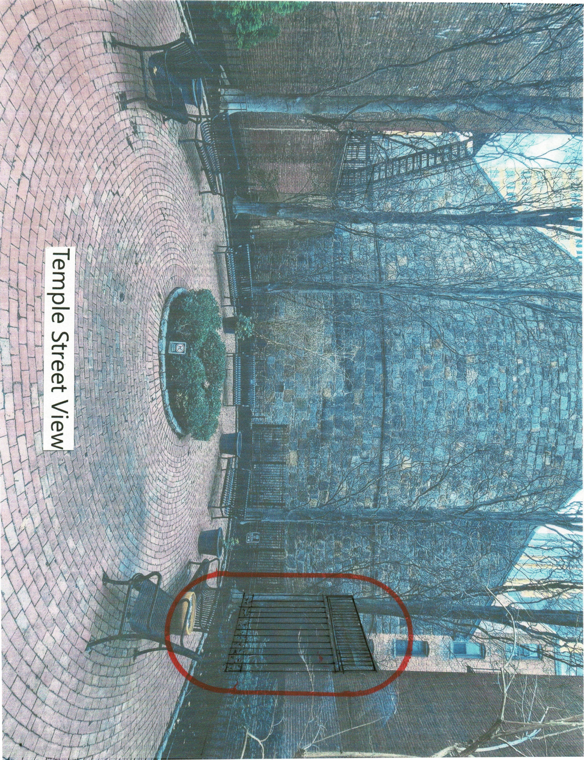
Temple Street View