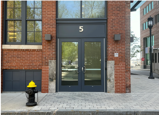
5 Channel Center Street