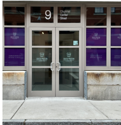
9 Channel Center