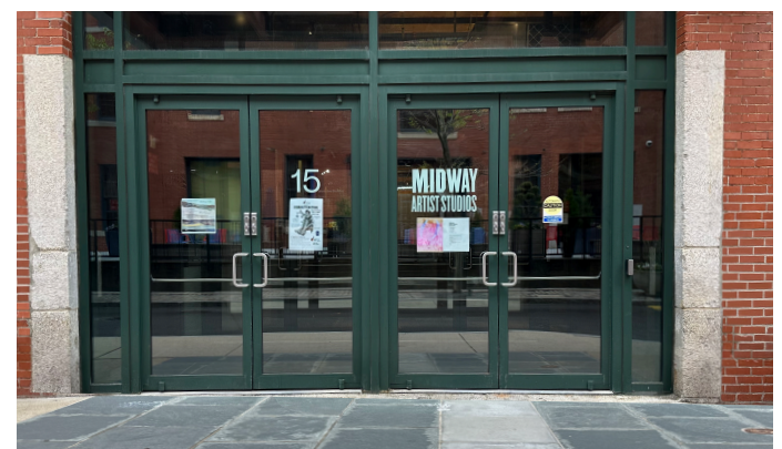
15 Channel Center Street