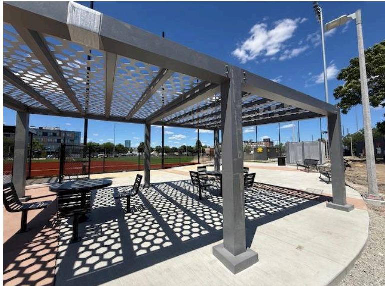
Shade shelter and table/chair installation]