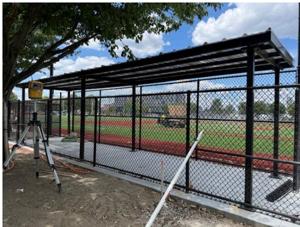
Shaded dugout installation, player benches to come