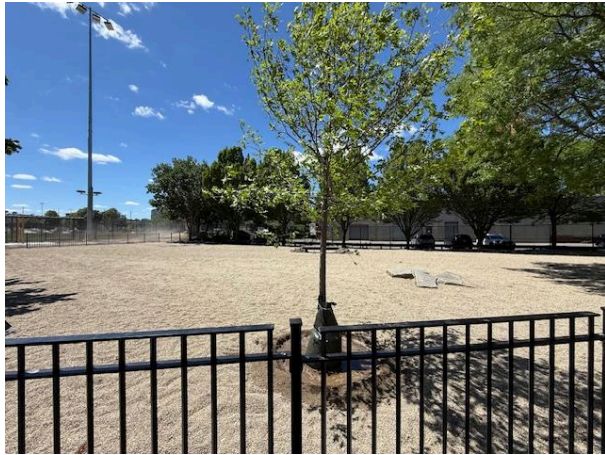
Dog park/ new tree installation