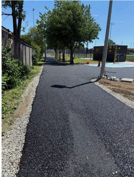
Asphalt sidewalk base course installation