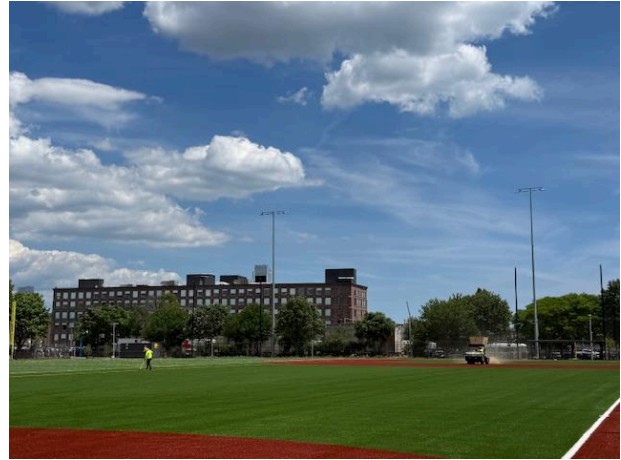
Artificial turf installation