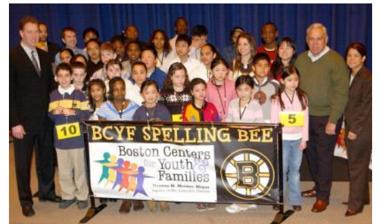
2008 Inaugural year of the BCYF Spelling Bee!

In 2008, BCYF started a new tradition for Boston by hosting the first citywide BCYF Spelling Bee. Over the following years, BCYF, in partnership with the Boston Bruins Foundation, has continued the tradition of the BCYF Spelling Bee. Each year, family members, friends, and teachers proudly cheer on the spellers at the citywide Bee.