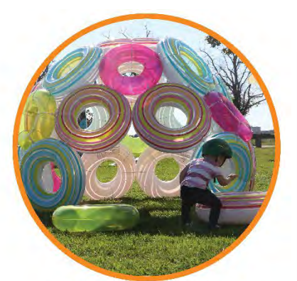
Discover Moakley! September 29, 2018