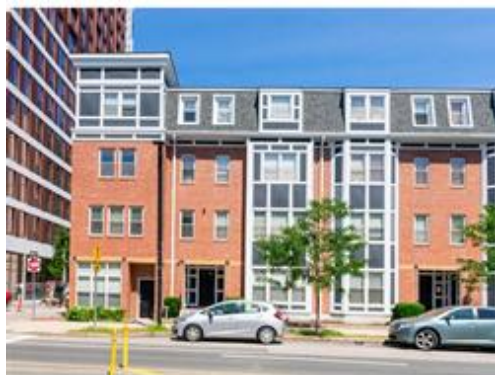
Exterior - Front

993 Tremont St - Unit 2 Boston, MA: South End, 02120-2258 Suffolk County