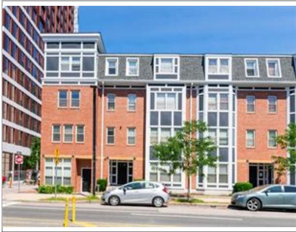
Exterior - Front

993 Tremont St U:2, Boston, MA: South End, 02120-2258