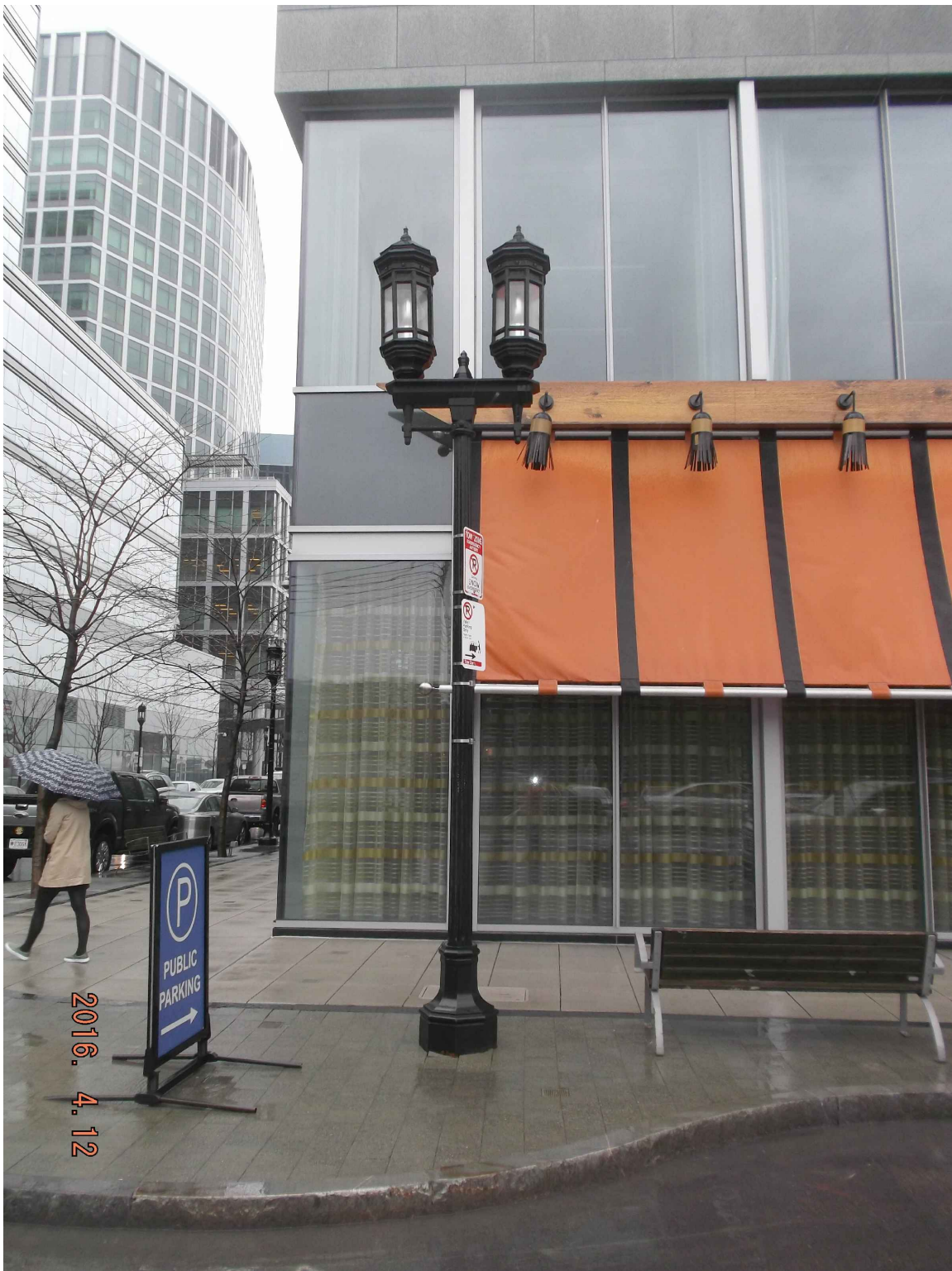
DOUBLE NAUTICAL LIGHT POLE EXISTING CONDITIONS - EXHIBIT X-13

extenet YOUR NETWORK. EVERYWHERE. SYSTEMS