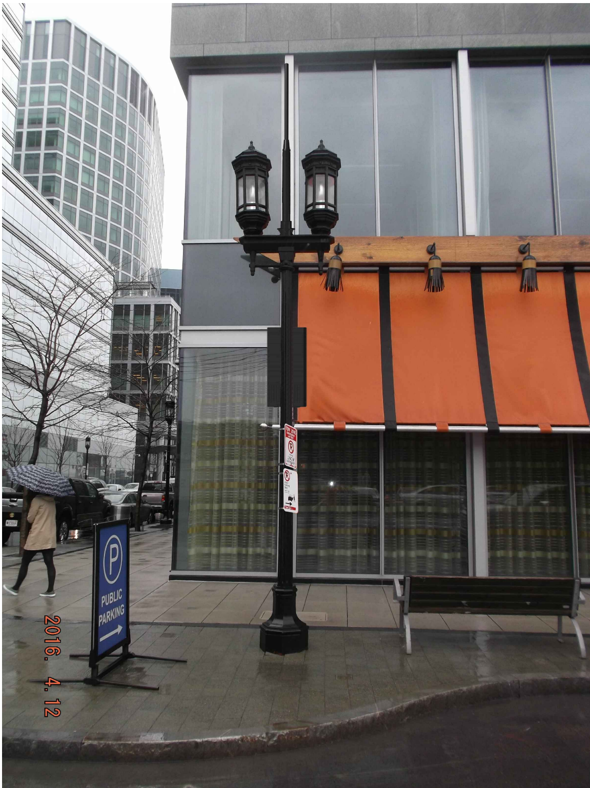
DOUBLE NAUTICAL LIGHT POLE PROPOSED PHOTOSIMULATION - EXHIBIT X-13

extenet YOUR NETWORK. EVERYWHERE. SYSTEMS